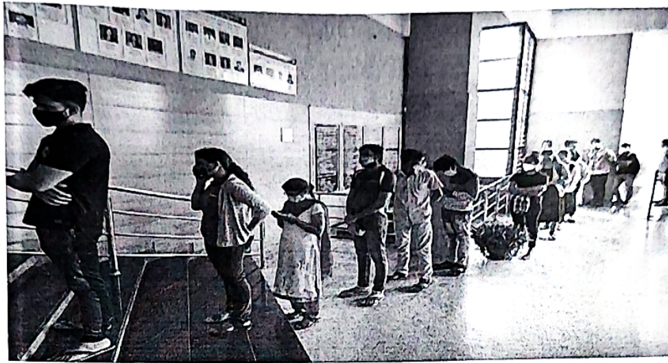
Figure 1: Making Line

Figure – 1: Shows that the students are making a line to take vaccination. We have taken all measures that sanitizing the rooms, temperature check and make them to follow social distancing etc.