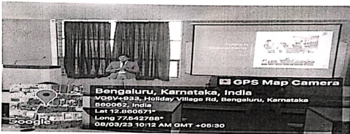
Fig 3. Addressing the participants by the Speaker of the day