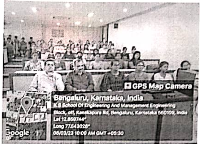
Fig 2. Participants in the Event