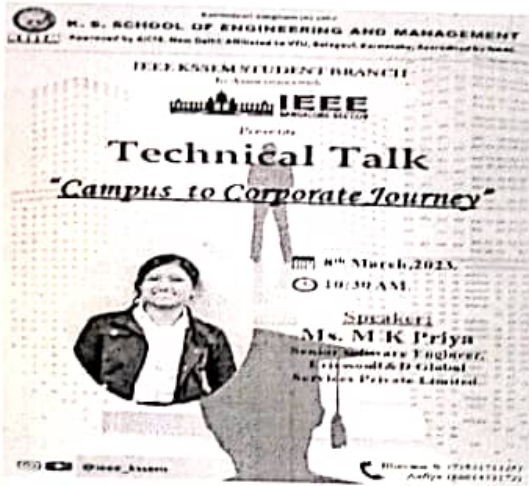
Fig 1. Invitation for the event

DEPARTMENT OF ELECTRONICS AND COMMUNICATION ENGINEERING