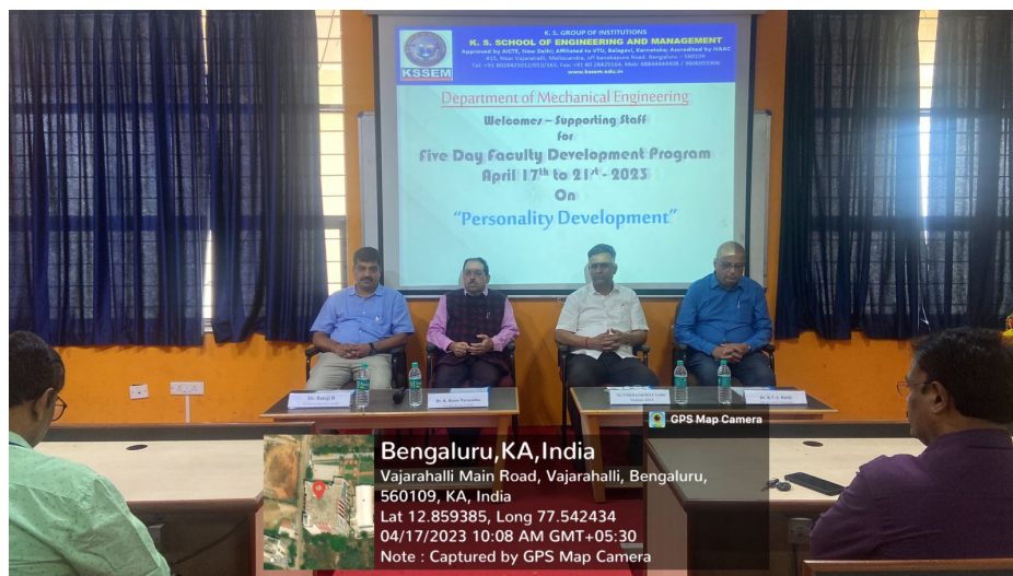
Figure: Inauguration of 5 day FDP

During first session speaker tried to introduce the importance of personality development to the participants in their personal and professional life. Also, tried to explain the advantages of having good communication skills with the respective stake holders & their effect on the growth of the institution.