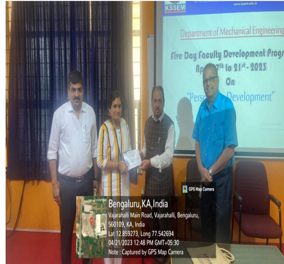
Figure: Certificate Distribution during valedictory